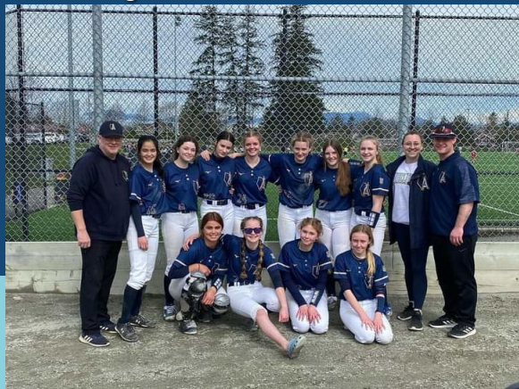
U15A 2008 Angels in White Rock