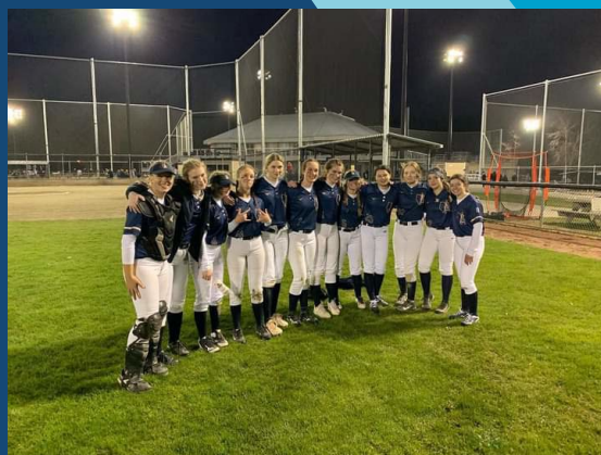
U17A Angels at Softball City